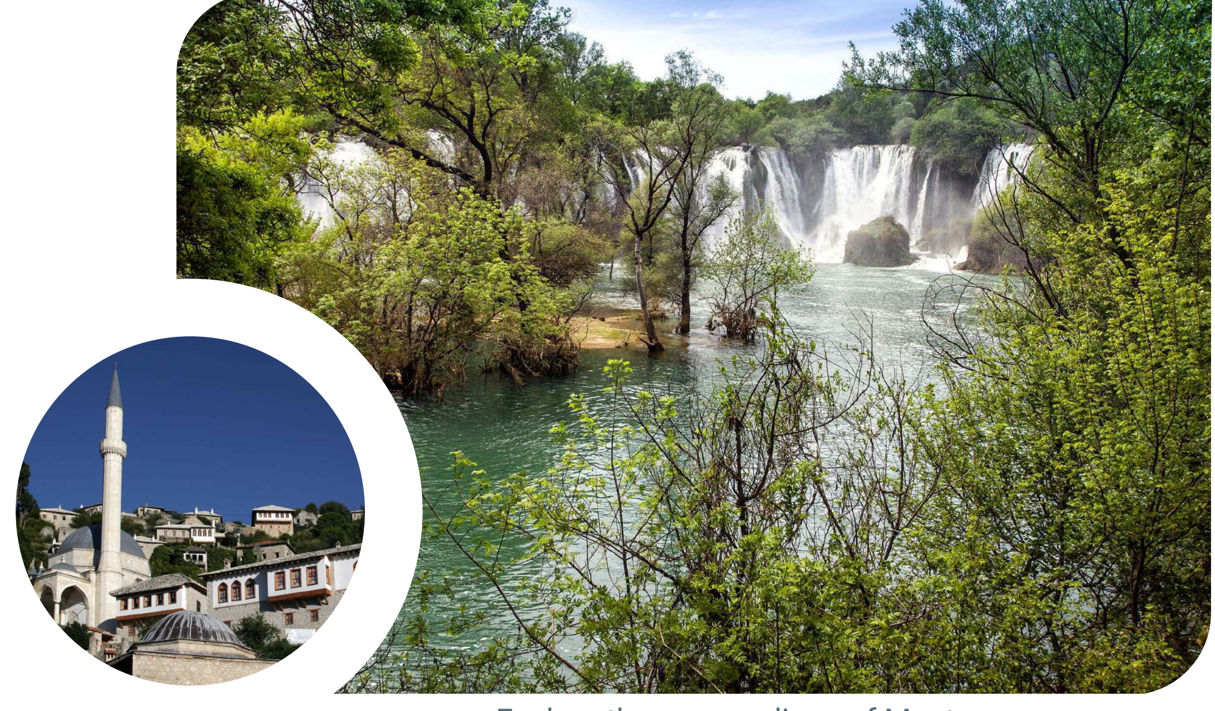
Explore the surroundings of Mostar