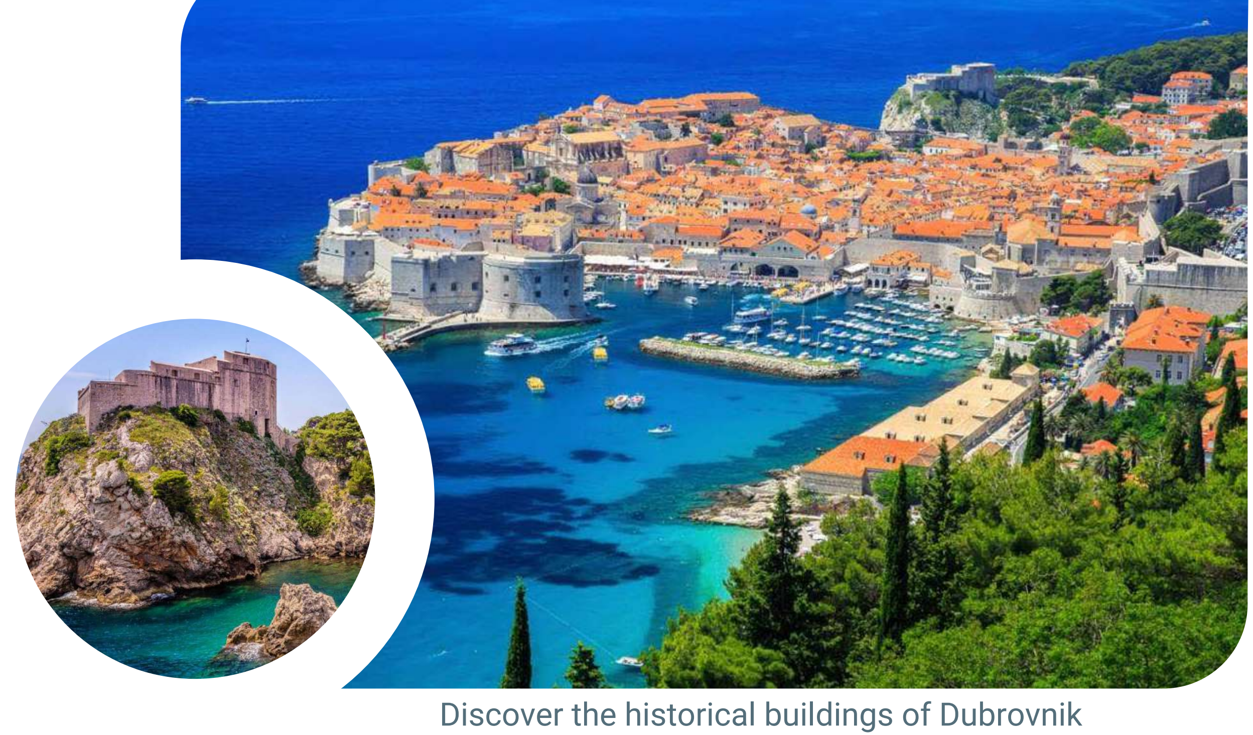
Discover the historical buildings of Dubrovnik