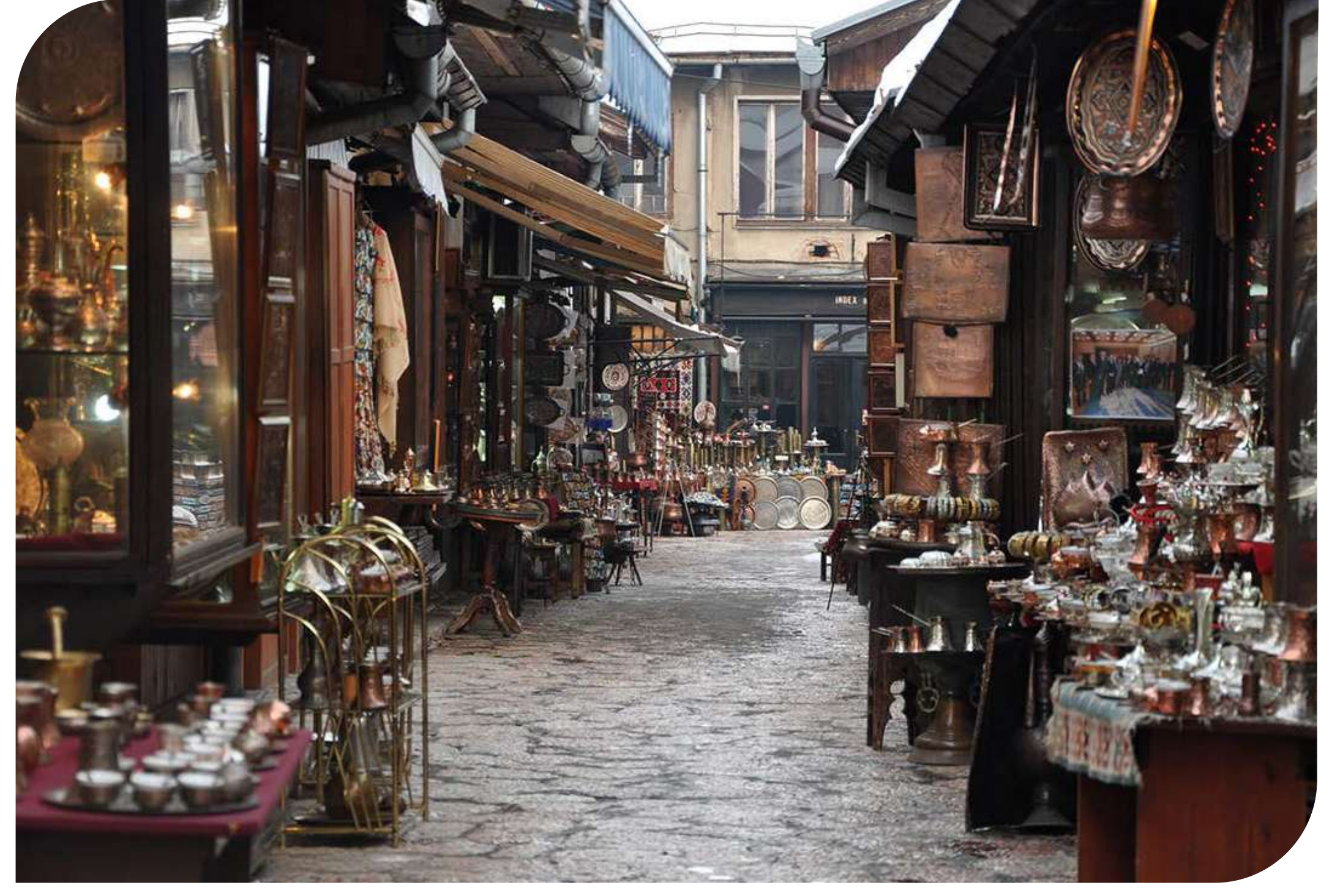
Welcome to the lovely Bosnia and Herzegovina