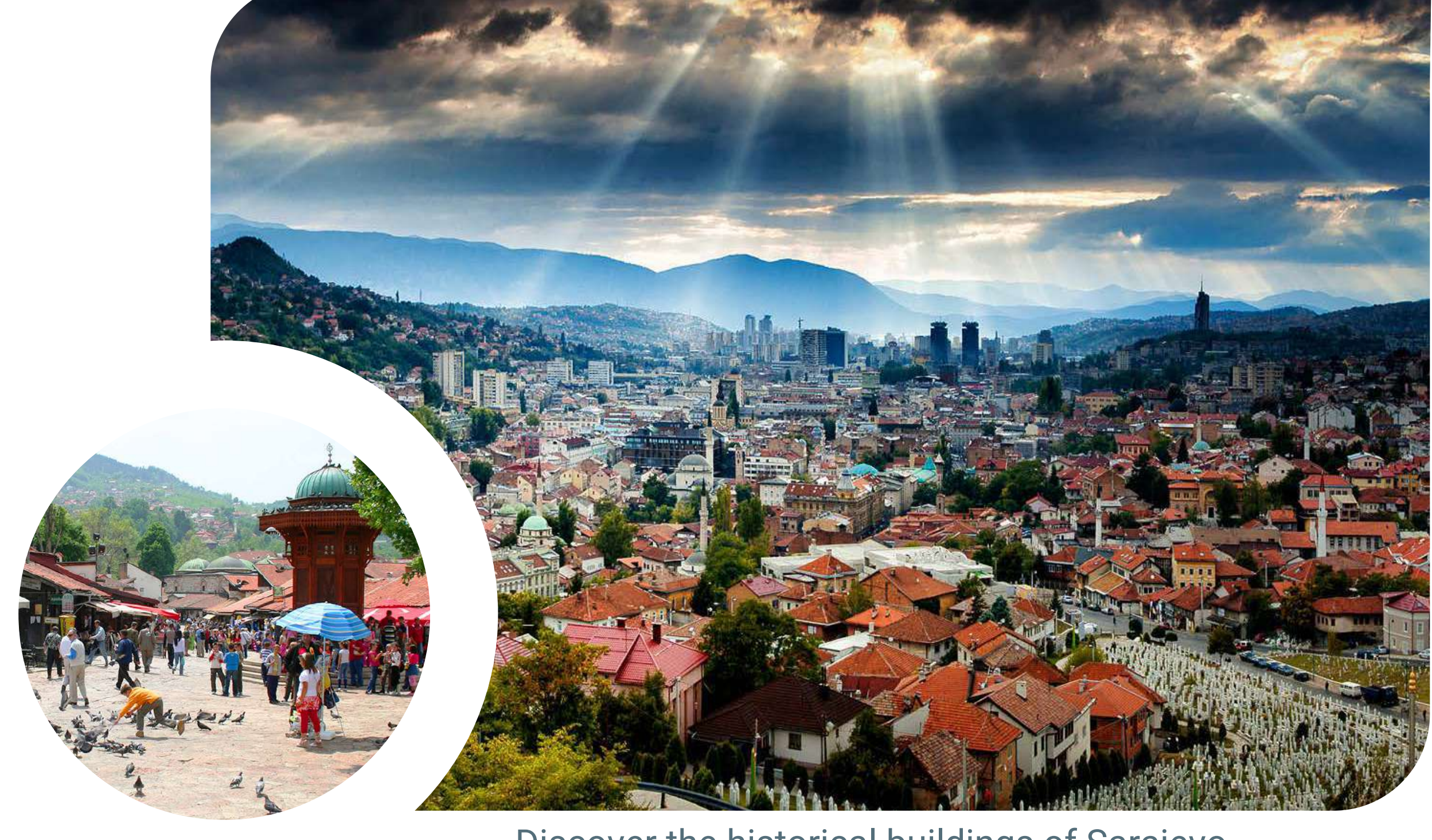
Discover the historical buildings of Sarajevo