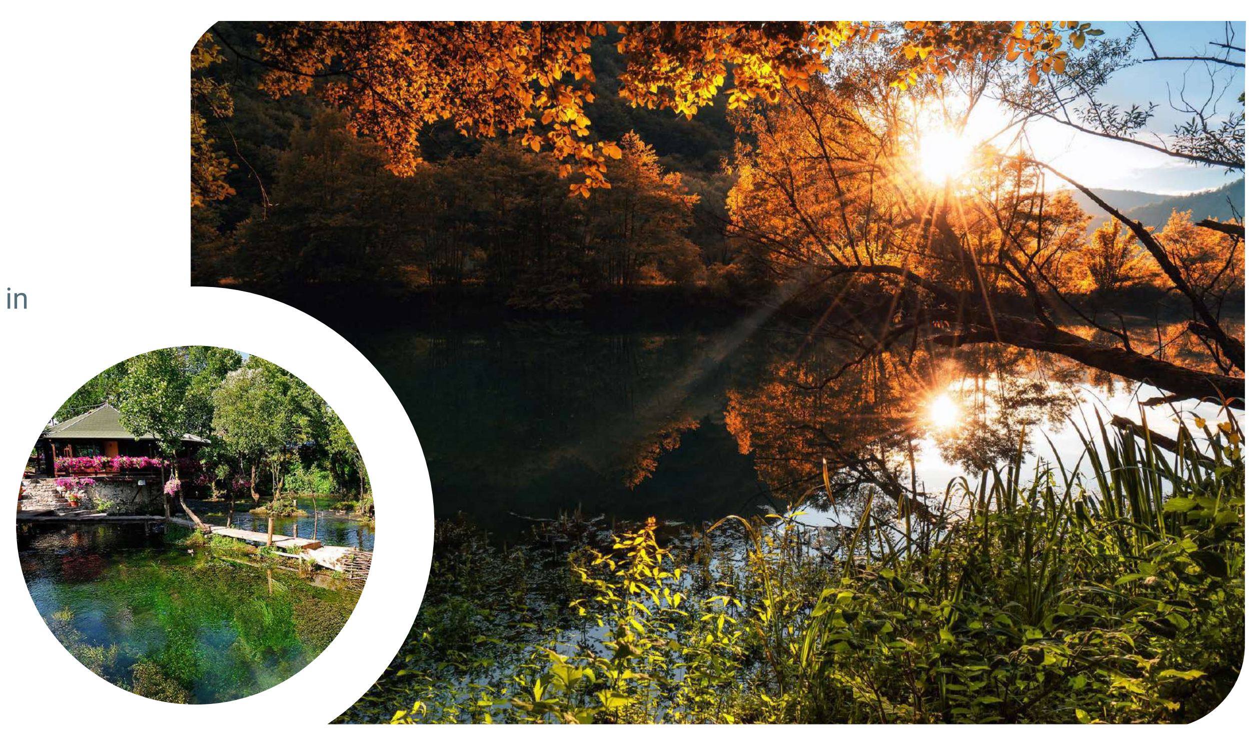
Green River Una