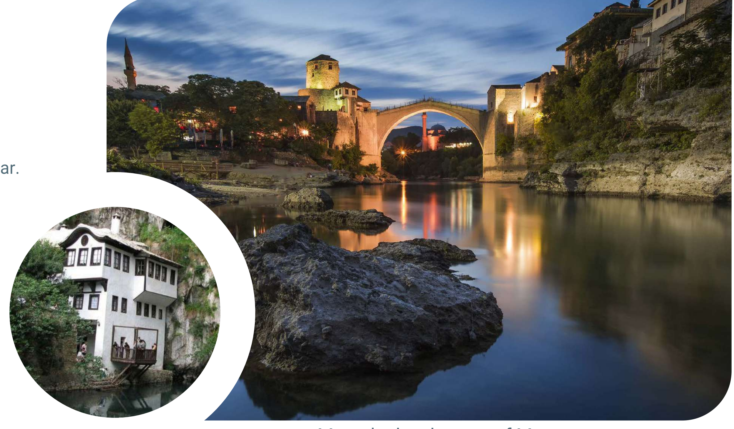
Meet the lovely town of Mostar