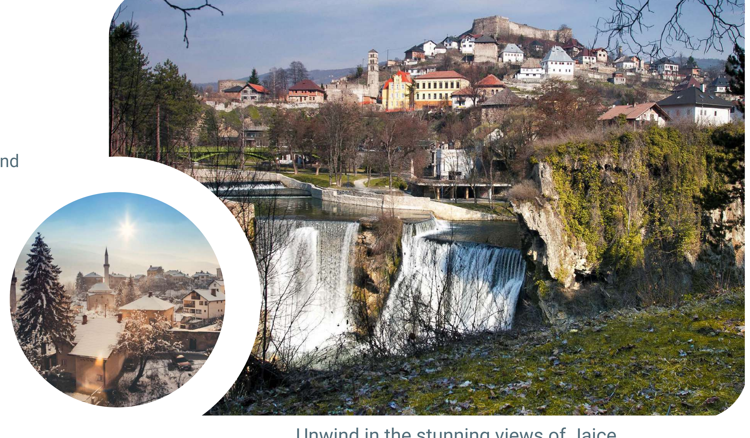
Unwind in the stunning views of Jajce