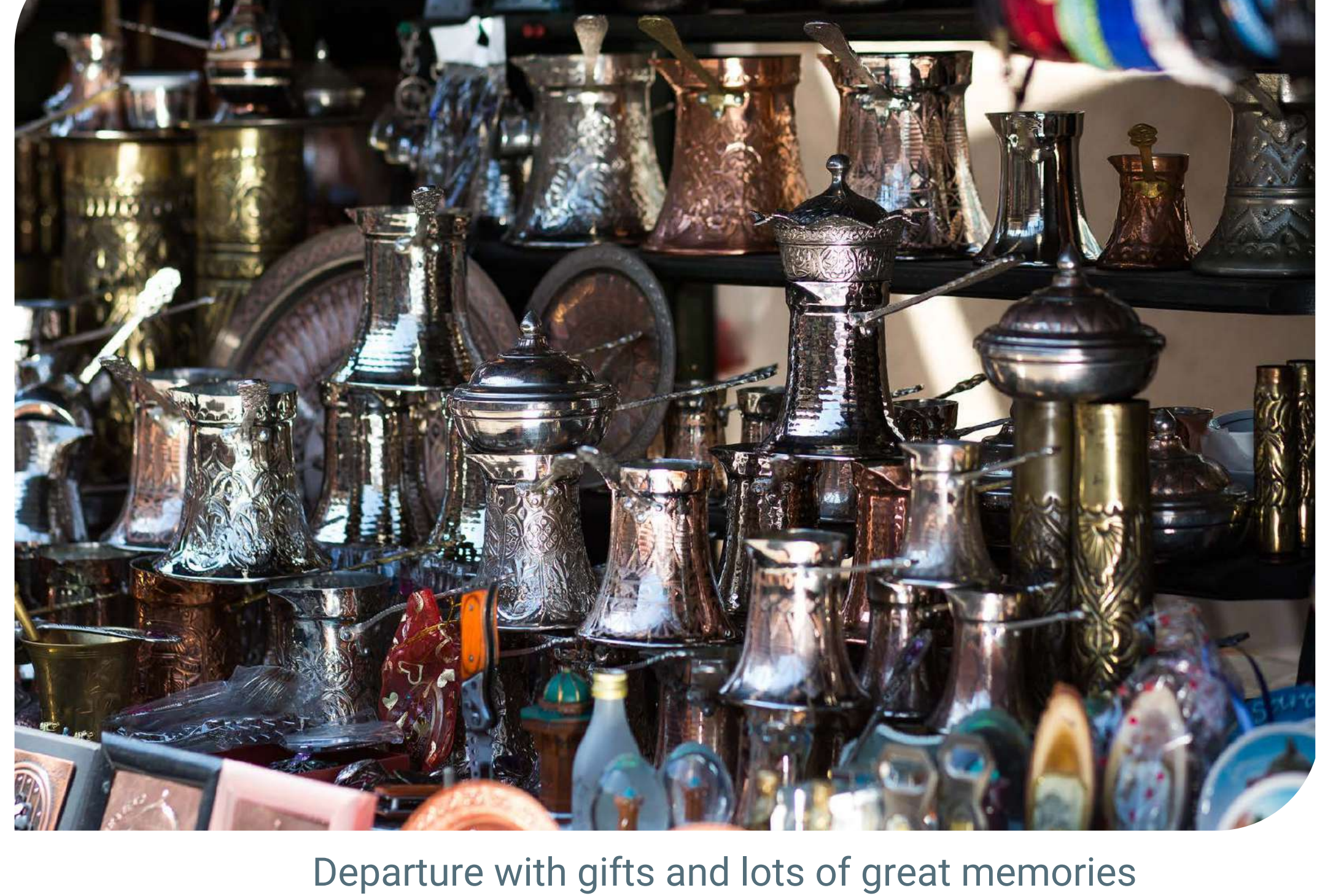
Departure with gifts and lots of great memories