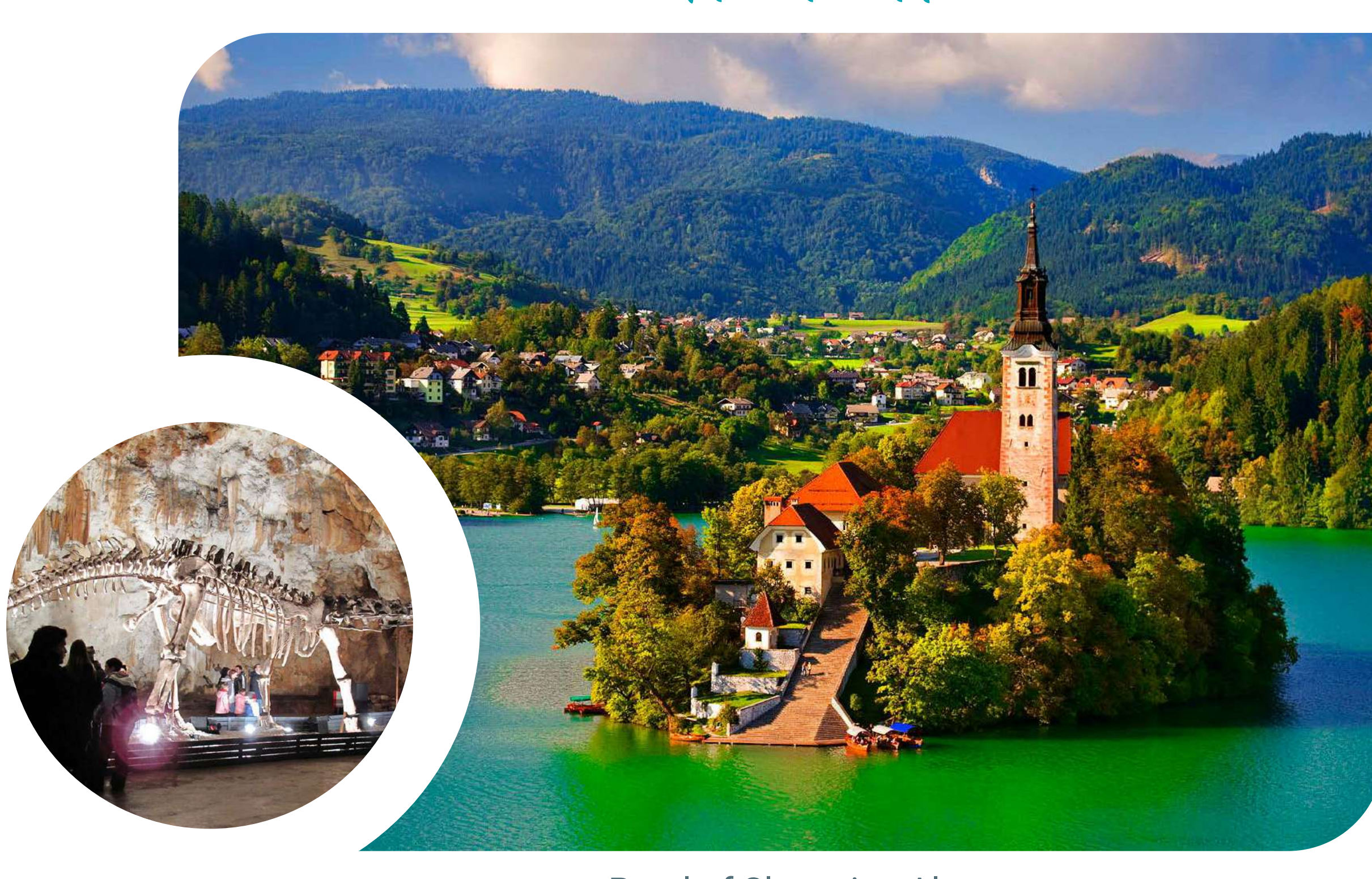
Pearl of Slovenian Alps