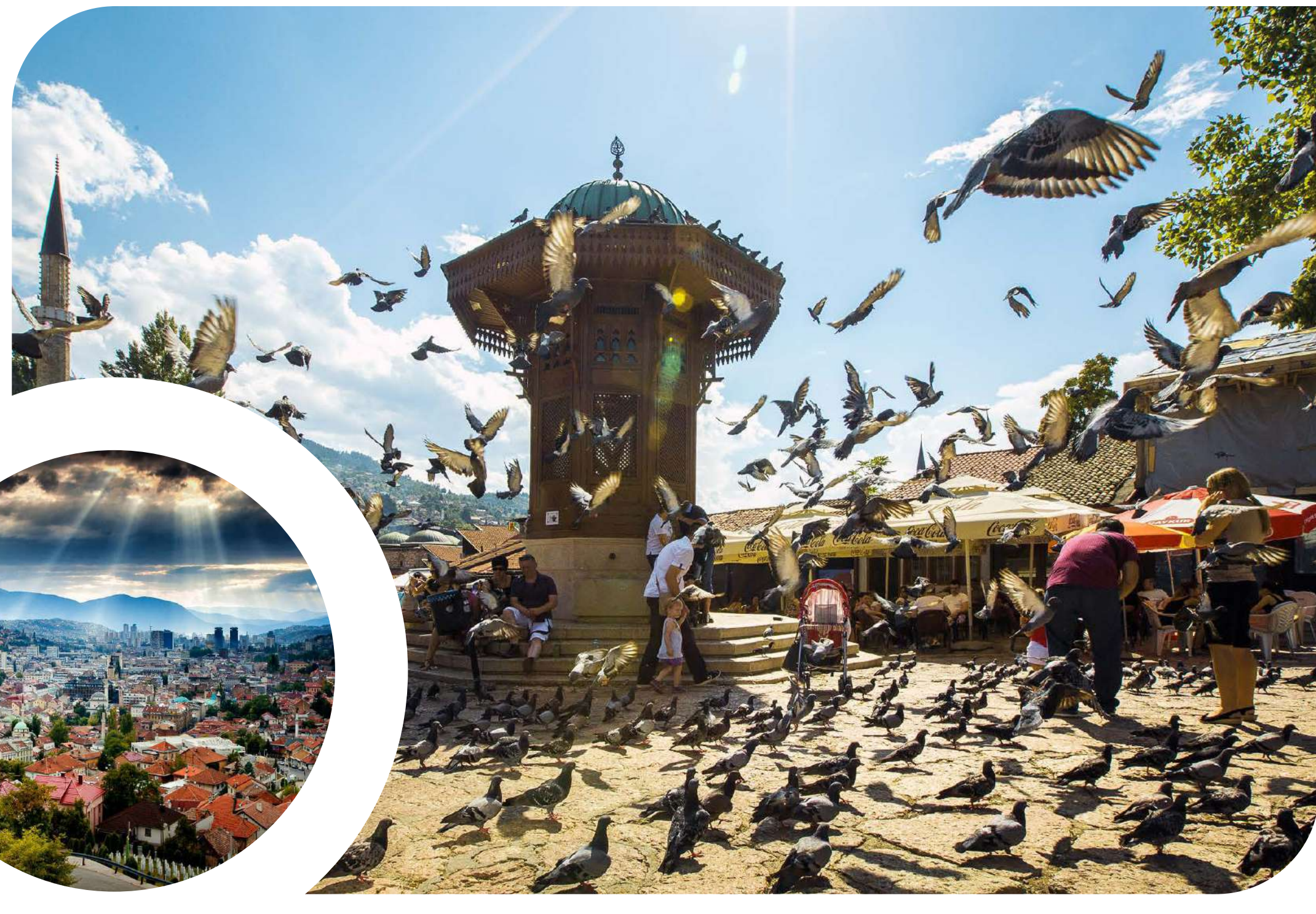
Welcome to the lovely Sarajevo