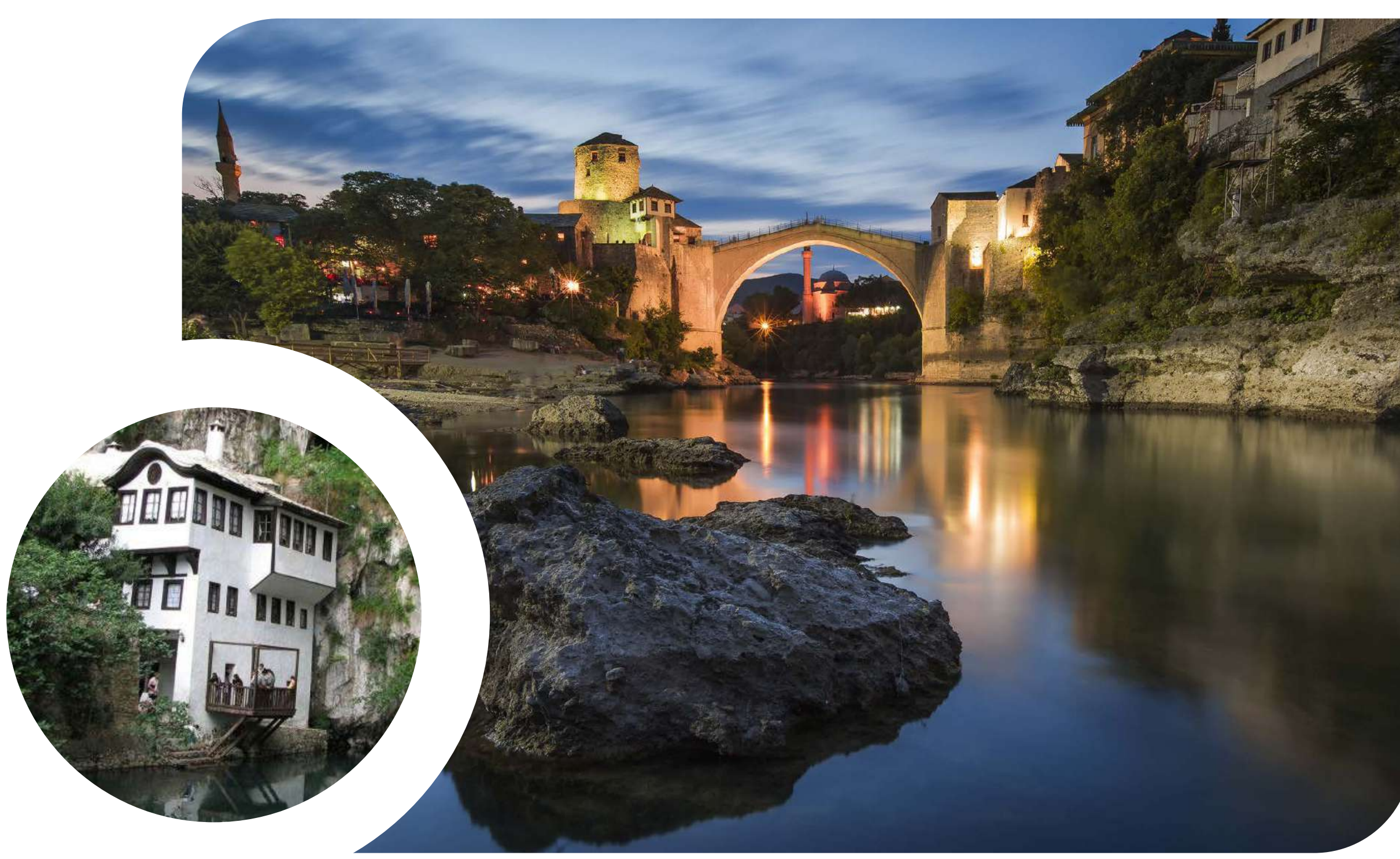
Meet the lovely town of Mostar