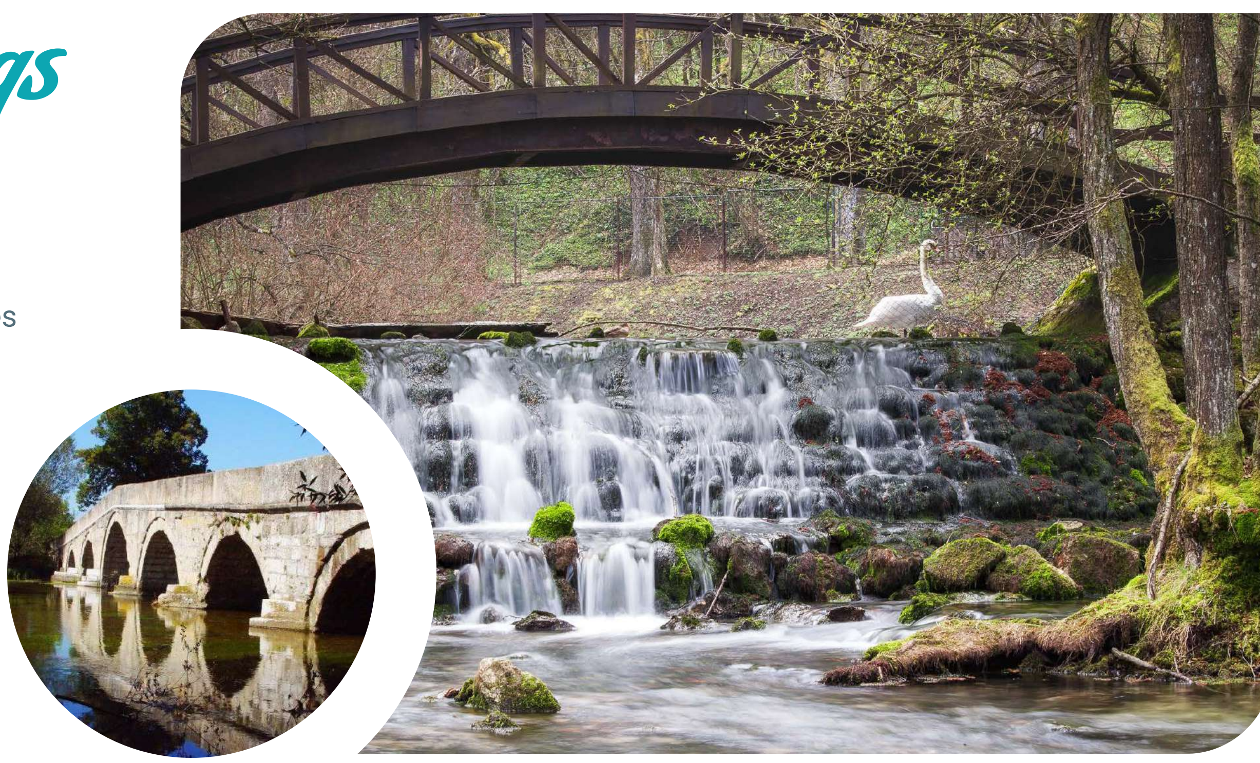
Enjoy a relaxing tour in the Vrelo Bosne Park