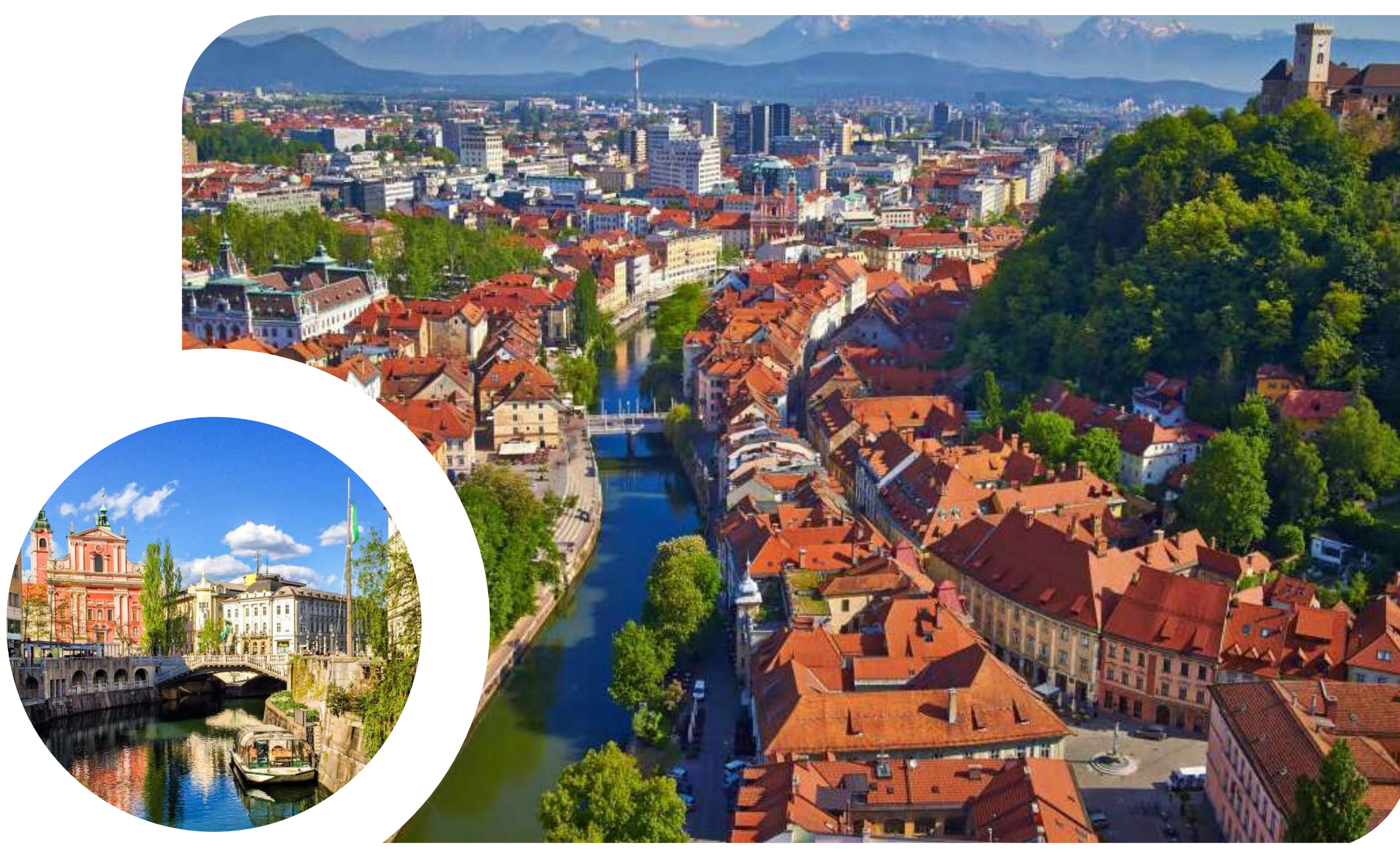
Discover the historical buildings of Ljubljana