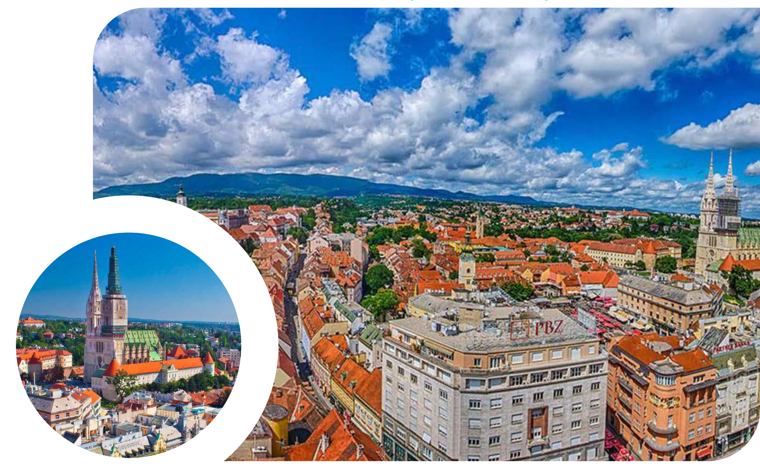
Capital of Croatia