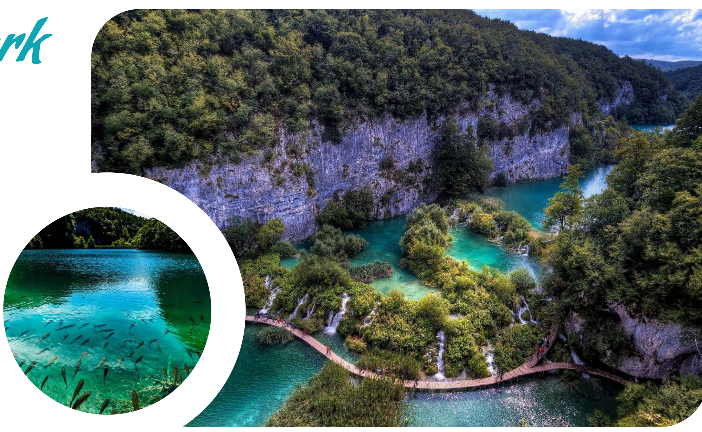
UNESCO World Heritage